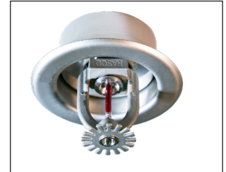
Model F1FR40 Pendent Recessed, F1 Escutcheon (F2 escutcheon similar)