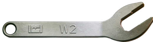
Model W2 (pendent)