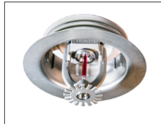
Model F1FR40 Pendent Recessed, FP Escutcheon

Note: Not all versions of the product are shown.