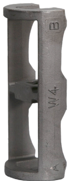
Model W4 (recessed pendent)