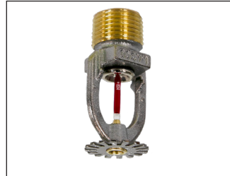
Model F1FR40 Pendent

Table A provides a summary of the approvals and availability for the Model F1FR40 sprinkler.