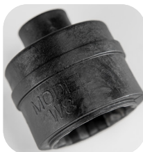
Reinforced plastic Model W8 for spare sprinkler cabinet.

Robust stainless steel metal wrench available for repeated use.