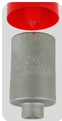
Install without removing the protective cap with Model W3

Dedicated emergency wrench: Economical reinforced plastic wrench available for the spare sprinkler cabinet.