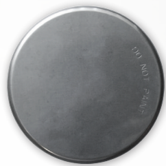
Stainless Steel Clad