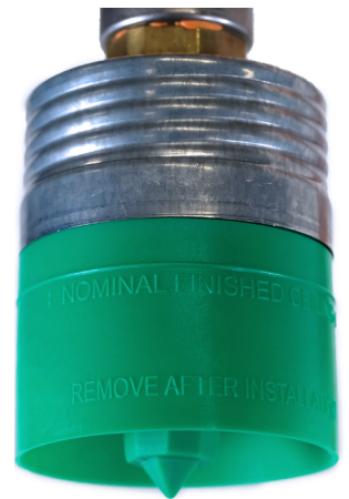
Align the indicator with finished ceiling. Caps are color coded per temp rating.