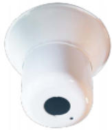
HB Two Piece