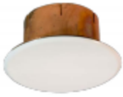
RFC Series Residential Sprinklers Flat Cover Plate, Concealed Pendent Sprinklers