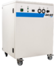
120R-40MQ3 & 2x120R-40MQ6 metal cabinet models shown