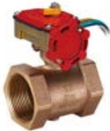
RBVT THREADED BUTTERFLY VALVE