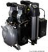
120R-40BQ3 metal cabinet